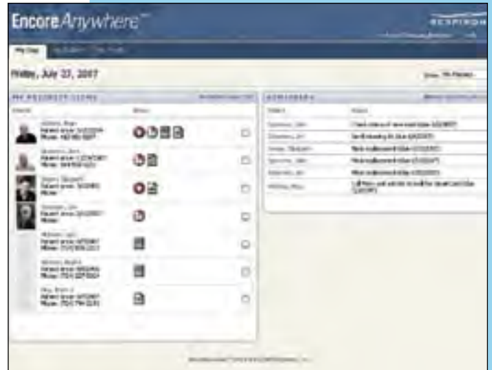
User profiles determine icon notification availability on the My Day page.

The My Day page is a user's first step to review patient treatment status.